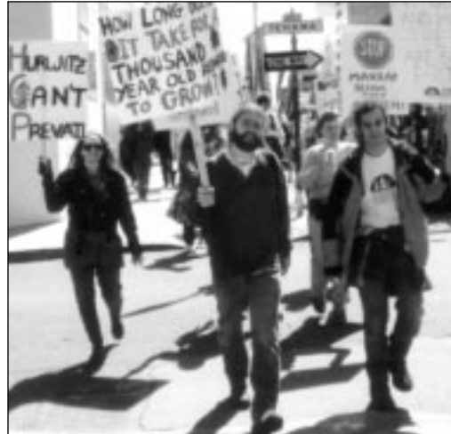
Forests Forever staffers march to save Headwaters.