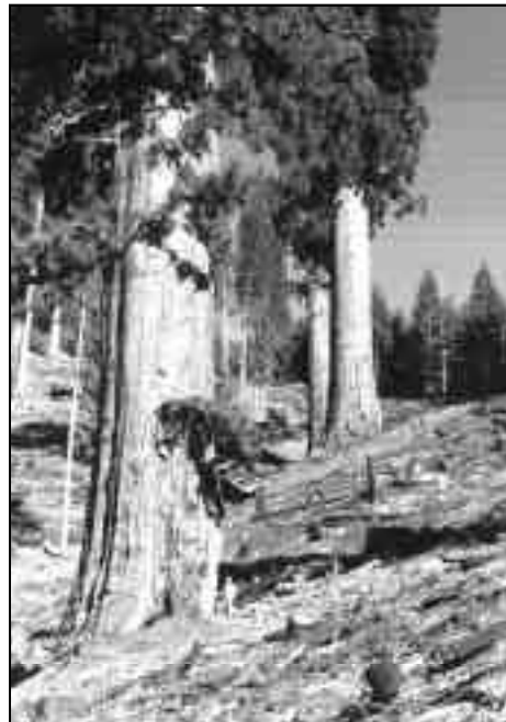
Peyrone Grove, GSNM

Although the designation protects many acres of sequoias to a great degree, the president specified that timber sales authorized before Jan. 1, 2000, within the monument boundary would continue for up to three years. The Forest Service estimates