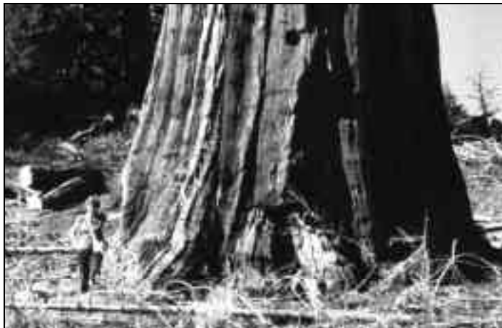
The Charlene Little Tree, Apocalypse Grove, GSNM