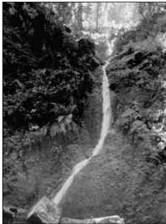
Ventana Wilderness roadless area

After months of developing a variety of alternatives, the Forest Service released its results in two policy proposals: the new