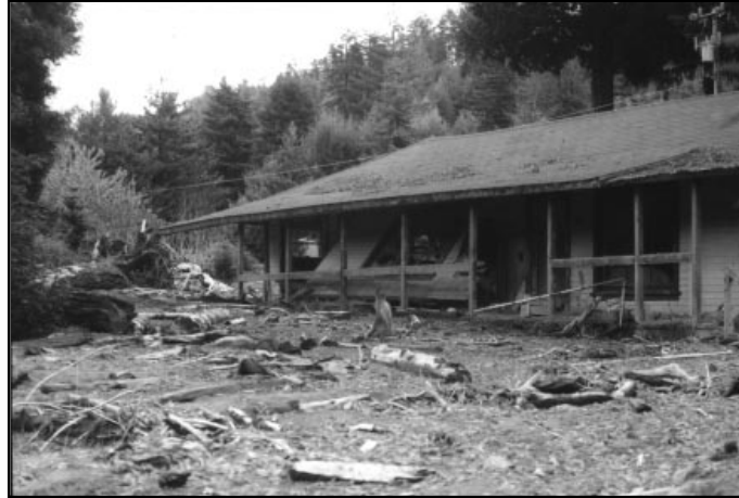
Stafford home wrecked by mudslide

The California Public Employees' Retirement System (CalPERS) on Nov. 26, 1997,