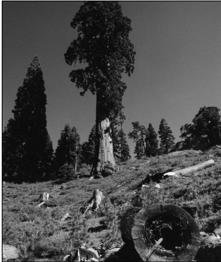
A lone giant sequoia surrounded by a clearcut.

of up to 1,000 acres each. Forest activists say that these projects are thinly disguised timber sales.