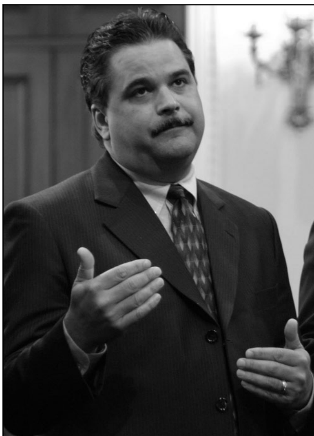
Resources Committee chairman Richard Pombo