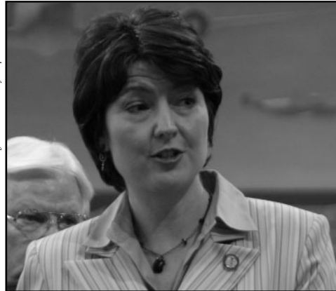
Rep. Cathy McMorris, chairwoman of the Resources Committee's NEPA Task Force