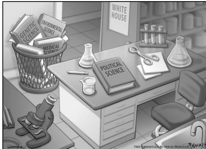
Clay Bennett

Public Employees for Environmental Responsibility intervened in the suit. The group maintained that the Forest Service, "drove its scientists who disagreed with the increased logging targets out of the