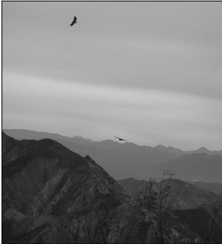
Condors soar above the mountains of Los Padres National Forest.